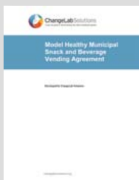
Model Healthy Municipal Snack and Beverage Vending Agreement