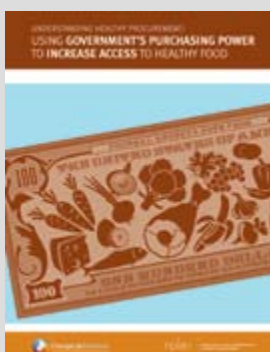
Understanding Healthy Procurement